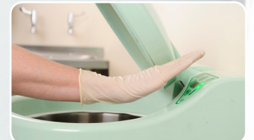
Hands free operation