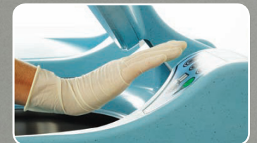
Hands free operation

DDC Dolphin, Pulpmatic, Panamatic, Incomatic, Hygenex, MicrobeSafe are Registered Trademarks